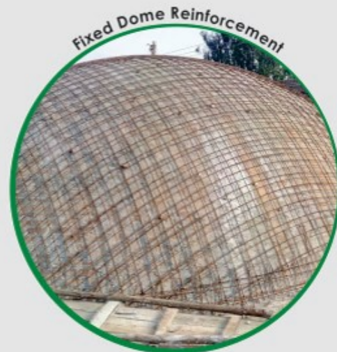
Fixed Dome Reinforcement

Tote Tiller pneumatic machine for the convey of the spices in large companies.