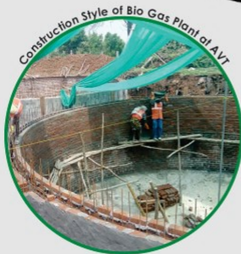
Construction Style of Bio Gas Plant at AVT