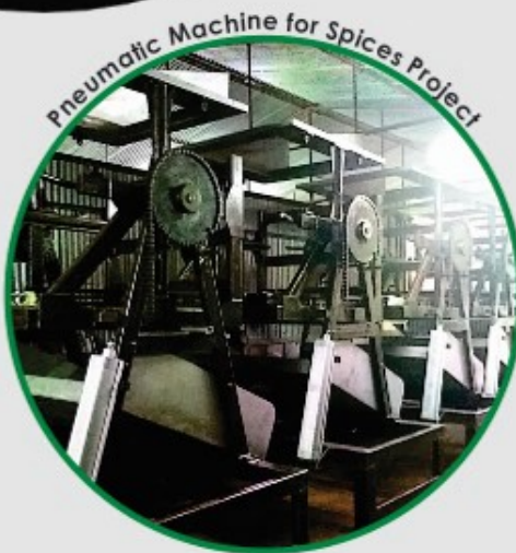
Pneumatic Machine for Spices Project